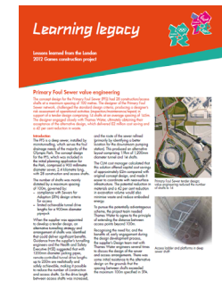
Example learning legacy document